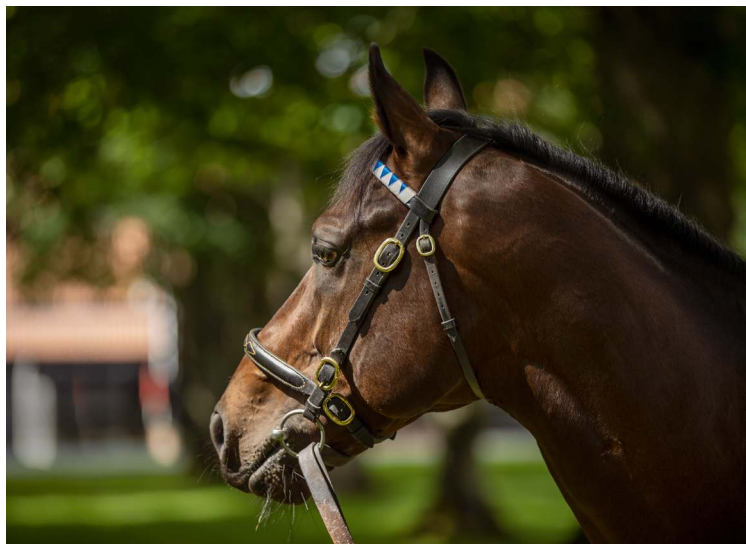
Pinatubo | Darley

Pinatubo (Ire) (Shamardal), Dalham Hall Stud 109 foals of racing age/0 winners/0 black-type winners 13:20-NEWMARKET, 5f, Hallasan (GB) £180,000 Goffs UK Premier Yearling Sale 2023