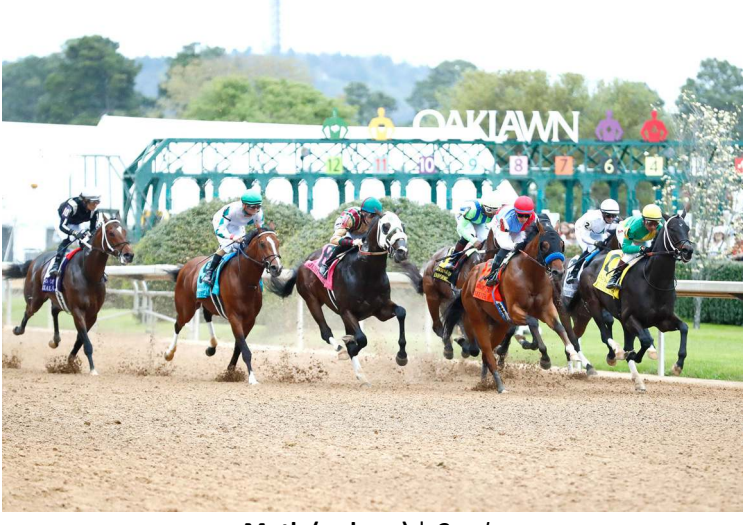
Muth (red cap) | Coady