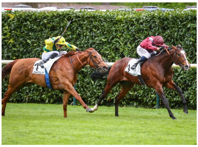
Saji taking Monday's Prix Sigy