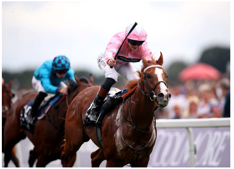
Live In The Dream