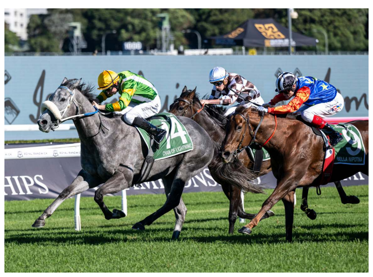
Chain Of Lightning

Chain Of Lightning (Aus) (Fighting Sun {Aus}), the surprise winner of the G1 T. J. Smith S. at Randwick earlier this month, is set to be sold before a potential appearance in the G1 Queen Elizabeth II Jubilee S. at Royal Ascot on Saturday, June 22.