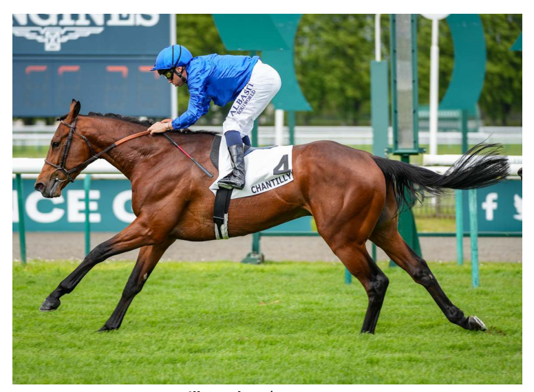
Will Scarlett