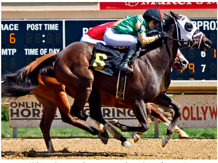
My Girl Kew became the newest stakes winner for Mo Town in the Southern Park S.