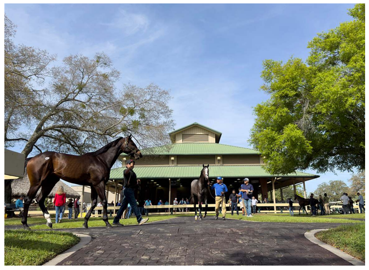
OBS sales grounds