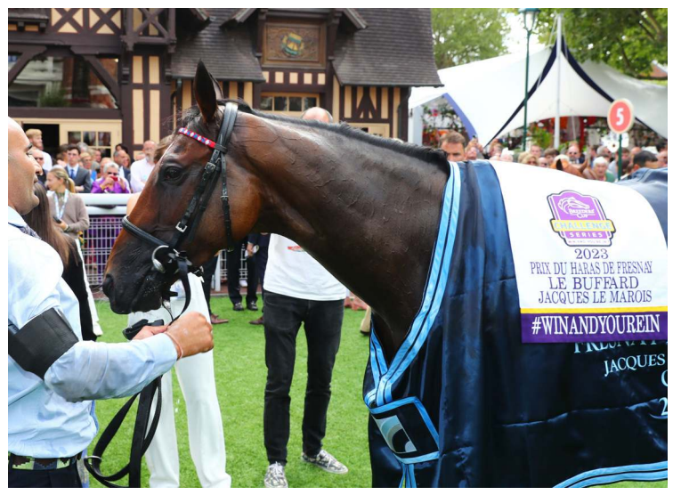
The Breeders' Cup will offer 82 'Win and You're In' opportunities spread across 12 countries | Scoop Dyga

The 2024 Breeders' Cup Challenge Series: Win and You're In will consist of 82 races in 12 countries and host track Del Mar will run six, the organization announced via release Monday.